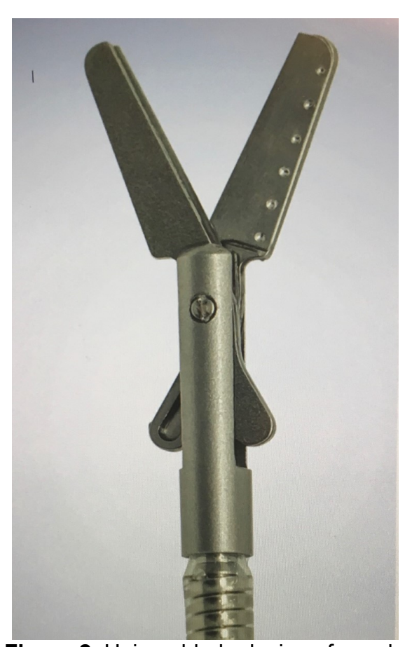
Figure 2. Unique blade design of novel, disposable endoscopic scissors.